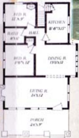
Floor Plan—The Winthrop